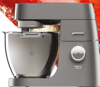
CHEF TITANIUM XL KVL8300S