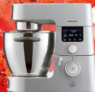
COOKING CHEF KVC9060S