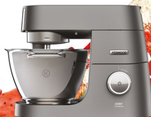
CHEF TITANIUM KVC7300S

when you purchase a qualifying Kenwood Kitchen machine between 26th April - 31st July 2018