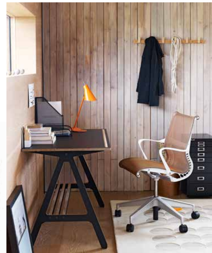
Furniture has both form and function. Great craftsmanship and beautifully engineered details are seen in furniture that is built to last.