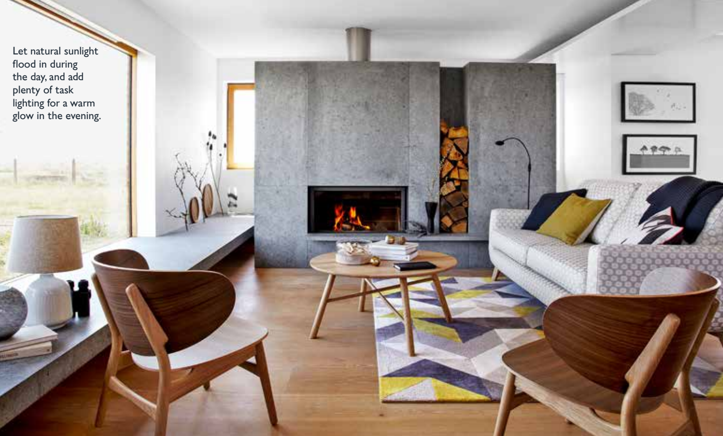
Let natural sunlight flood in during the day, and add plenty of task lighting for a warm glow in the evening.

Capture the laid-back look of Scandinavian living with this cool, calm scheme. Our Scandi look is as practical as it is beautiful, bringing together smooth shapes, natural materials and a simple colour palette. Here, we give you ideas for the elements you need to recreate the look in your own home. You'll find more ideas and inspiration at johnlewis.com/scandi , or pick up a copy of the latest Home book in our shops.