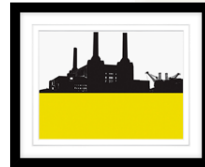
Choose pieces of modern art that reflect this pared-back style, with iconic silhouettes and graphic blocks of bright colour.