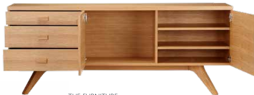
THE FURNITURE Simple shapes

Take a natural approach to materials and fill your home with an abundance of blonde wood furniture. Opt for simple shapes or curved details, and arrange in an uncluttered way.