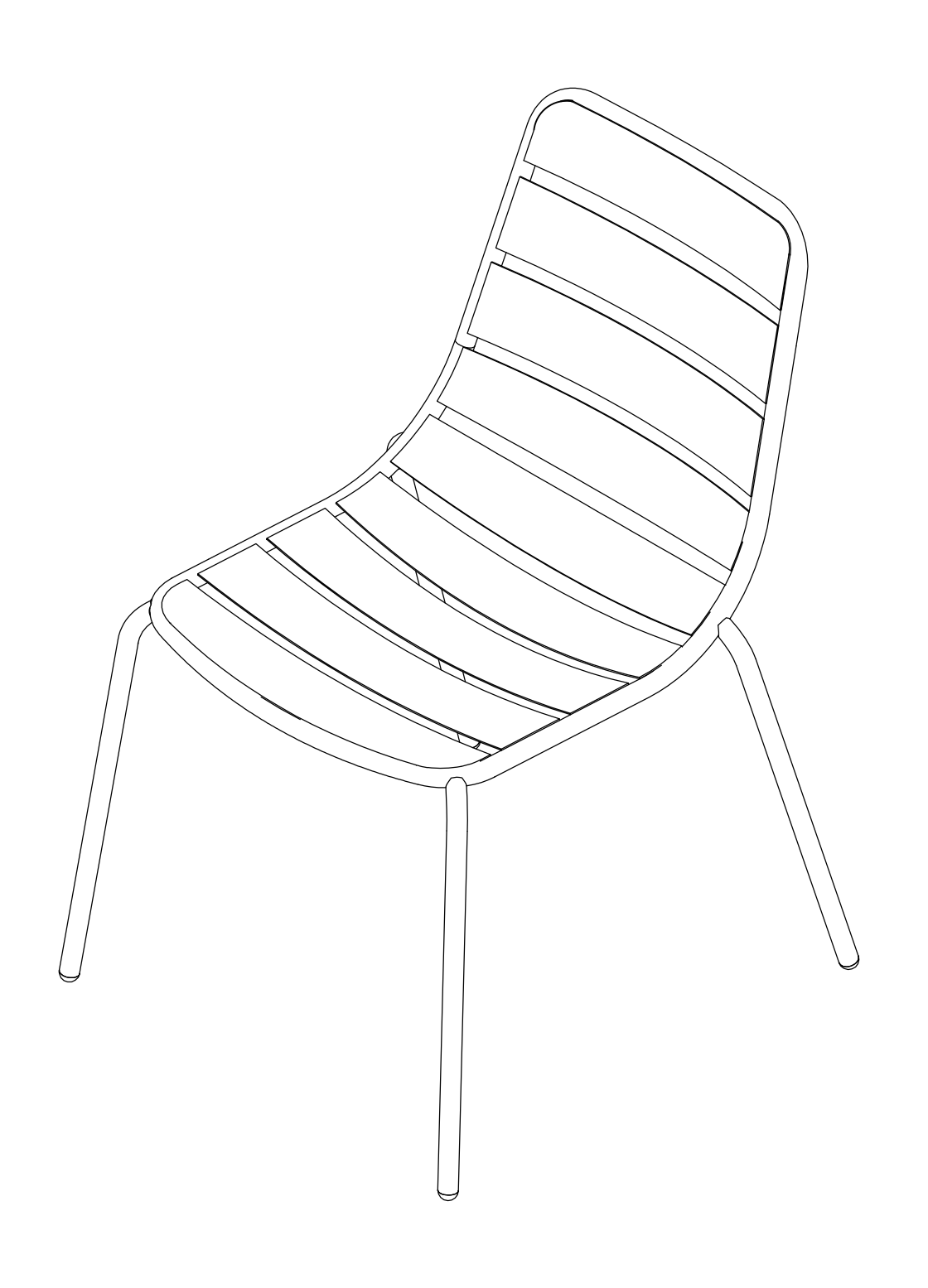
H84.4 W54 D60.7 cm