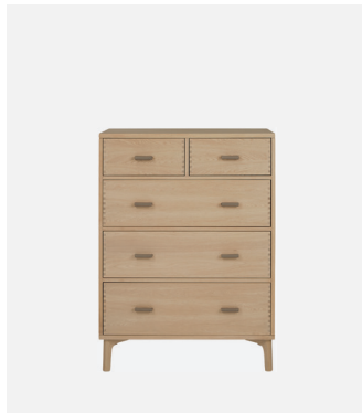
Nº049 5-drawer chest H116,5 W85 D46cm 803 12402 £525