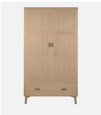
Nº049 Wardrobe H198,5 W110 D60cm 803 12403 £899