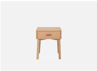
Nº049 1-drawer bedside H57,5 W47,5 D42,5cm 803 12401 £199