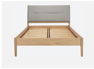
Nº049 Kingsize bedstead Fits mattress W150 L200 H99,5 W160,5 L222cm 803 42202 £699