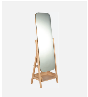
Nº049 Freestanding mirror H175 W55 D42,5cm 803 12412 £350