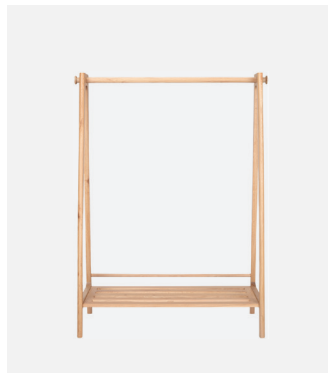
Nº049 Hanging rail H160 W123 D50cm 803 12411 £275