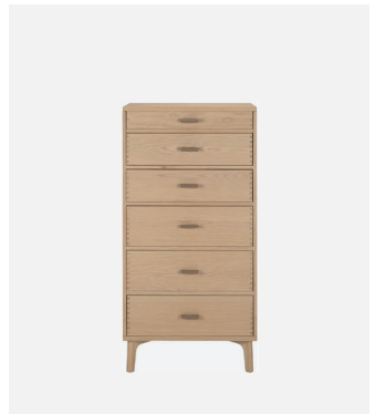
Nº049 Tallboy H130 W65 D46cm 803 12404 £599