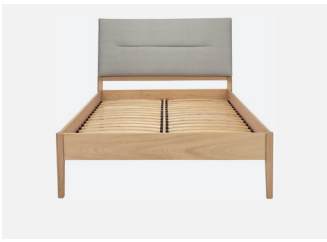
Nº049 Double bedstead Fits mattress W135 L190 H99,5 W145,5 L212cm 803 42201 £599