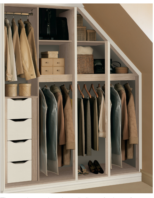
The continuous hanging rail allows for lots of storage and easy access.