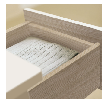
All drawers have a four sided construction for extra durability and come with soft close as standard.