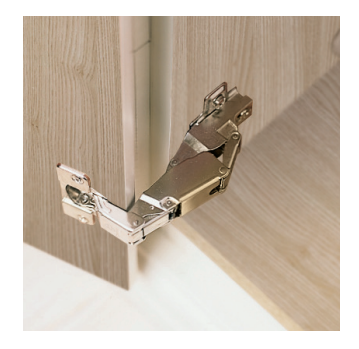
All John Lewis doors have four hinges to give them more strength and durability.