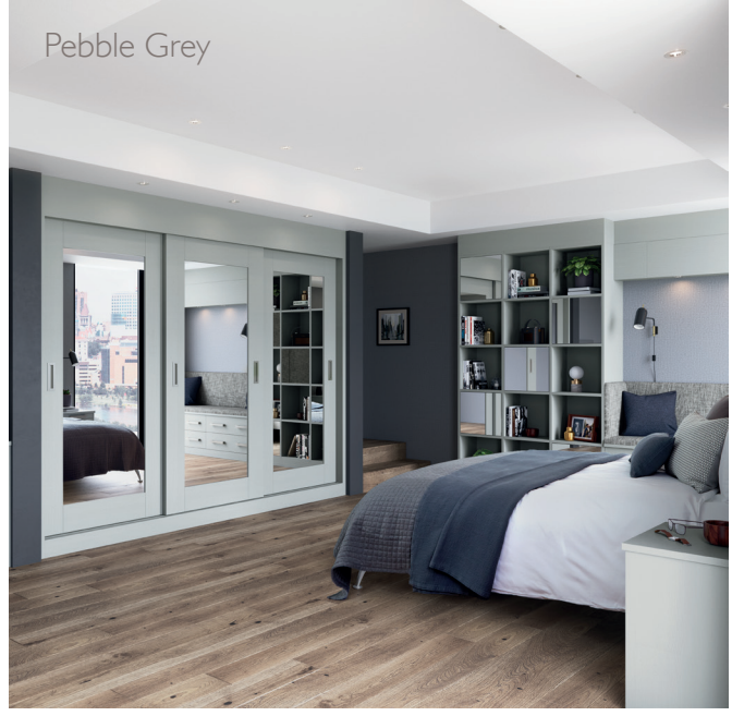
The Chilton range comes either hinged or with a sliding door option.