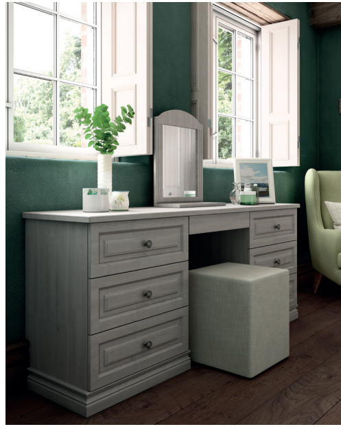
Dressing table creates further storage for your precious possessions.