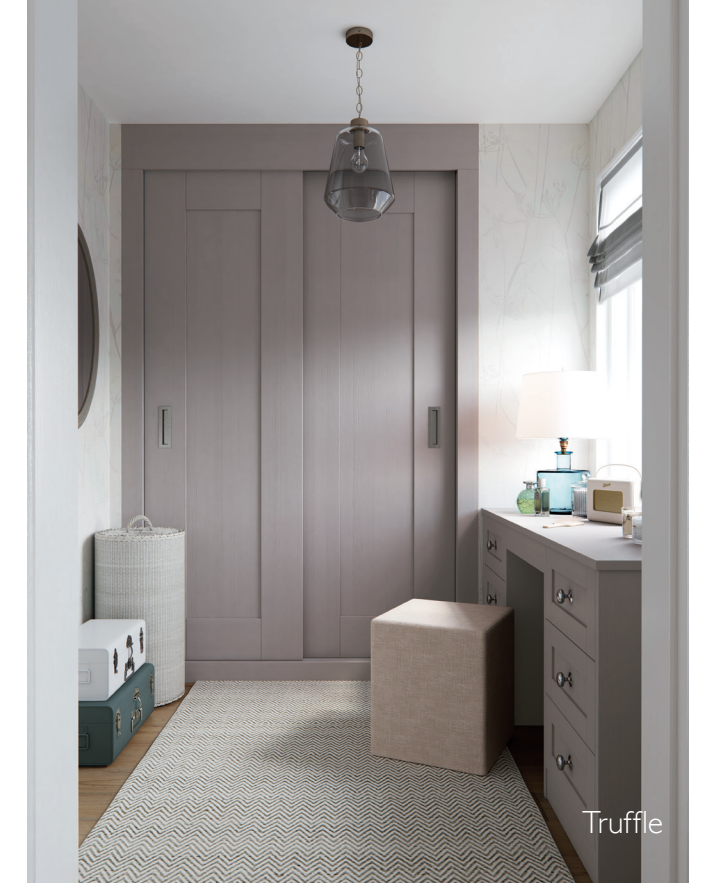
The Haddington range comes either hinged or with a sliding door option.

This range of fitted furniture features a lightly-grained painted finish with a tonal palette of eight colours. The collection is available with a wide range of fitted storage solutions to optimise the space in your room.