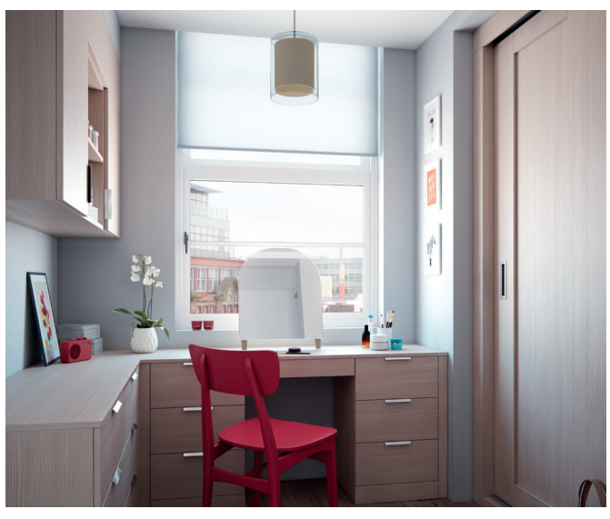
Also available as a sliding option, Lugano is hugely versatile. Above is a sleek solution for your box bedroom.