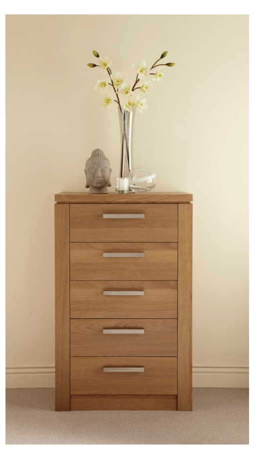
Five drawer chest

Verona comes in a choice of five finishes and two handle options, either a rustic knob or a nickel handle creating two very distinct looks.