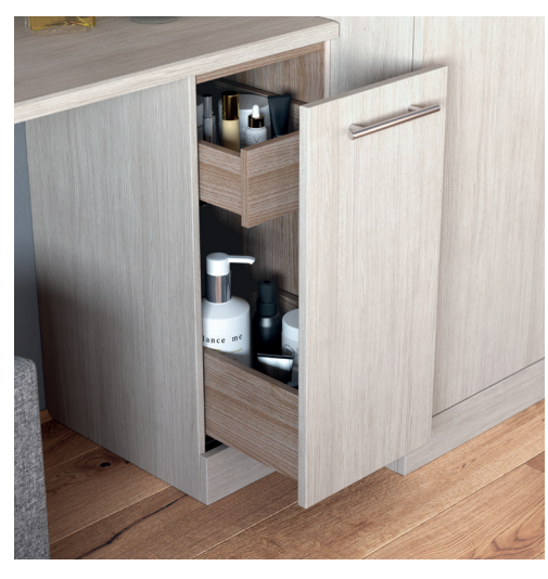
This handy cosmetic drawer is a great space for all those beauty essentials.

The simple design of our Acerra range guarantees a cool, minimalist look and provides the perfect blank canvas. With a choice of finishes, from wood grains to crisp white, you're sure to find a colour option you love.