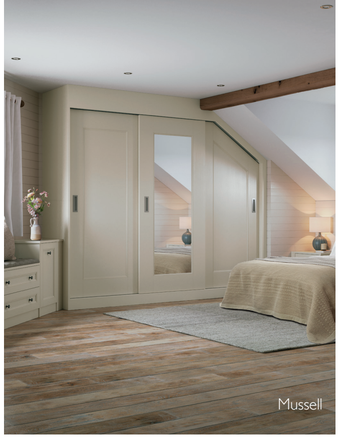
The Ashbourne range comes either hinged or with a sliding door option.

The Ashbourne range combines a painted finish with wood grain detail. Available in 8 different colours, you can create a floor to ceiling look that's totally suited to your bedroom.