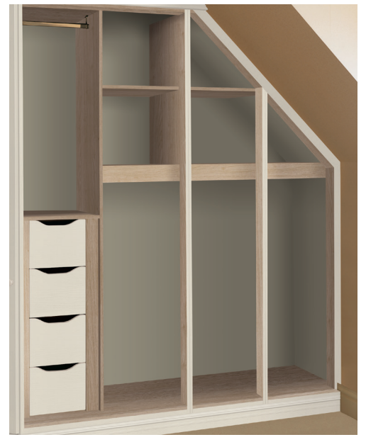
The internal floor comes as standard.

If your room is awkwardly shaped, or you have additional character features like sloping ceilings or chimney breasts, then the Front Frame construction will help you maximise your space. This construction method allows you to utilise the space from wall to wall and floor to ceiling. You can choose from a variety of interiors, from single or double hanging, shelving or interior drawers.