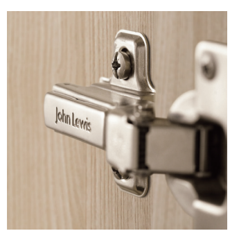
Hinge covers ensure you don't snag your clothes. Soft close doors featured in all wardrobes.