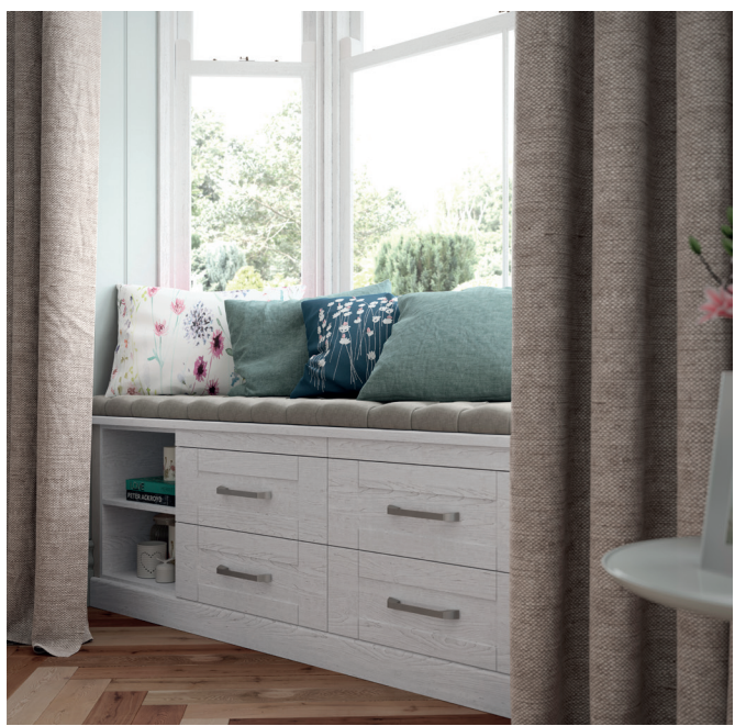
A window seat provides great storage and is practical too.