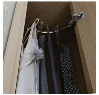
Curved hanging rails make the most out of any corner space.