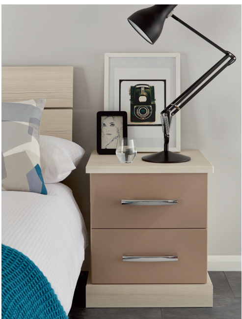
Choose a matching bleached spruce front or a contrasting mocha high sheen as shown here.