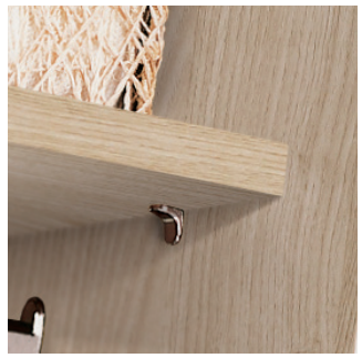
Solid nickel shelf supports offer extra strength and durability.