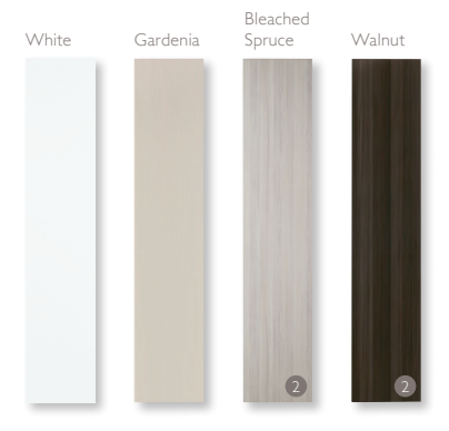
Door finish only