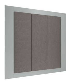
Suitable for any painted range