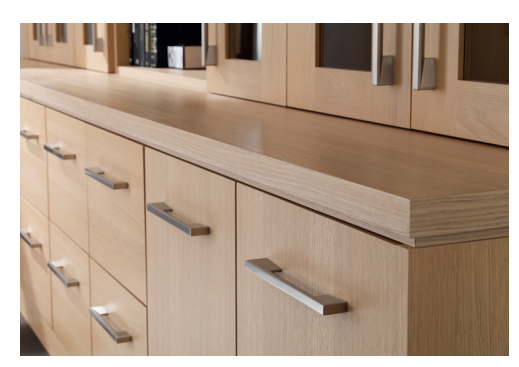
Handle in brushed Nickle