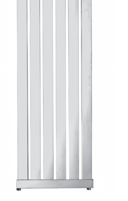
Lyme H1460 x W275mm H1460 x W360mm H1460 x W535mm H1960 x W275mm H1960 x W360mm H1960 x W535mm