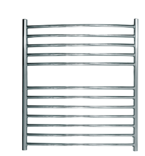
Sandsend curved H700 x W400mm H700 x W520mm H700 x W620mm