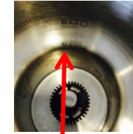
Cappuccino (bottom line)