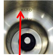
Caffe Latte (top line)

2. Insert whisk as shown and add cold milk to the corresponding line level in the metal jug: